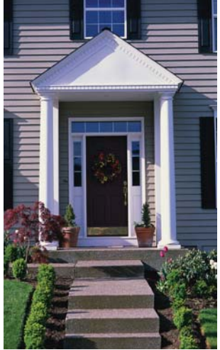
KEEP WINTER OUTSIDE YOUR HOME

Interested in learning how to save energy? Here are some great tips to lower your energy costs this winter, brought to you by the New York State Energy and Research Development Authority!